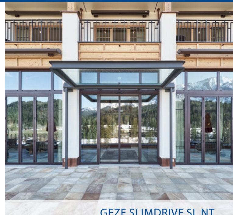
GEZE SLIMDRIVE SL NT

GEZE Benelux B.V. Industrieterrein Kapelbeemd Steenoven 36 5626 DK Eindhoven Netherlands Telephone: +31 (0)40 - 2629080 Fax: +31 (0)40 - 2629085 www.gezebenelux.com